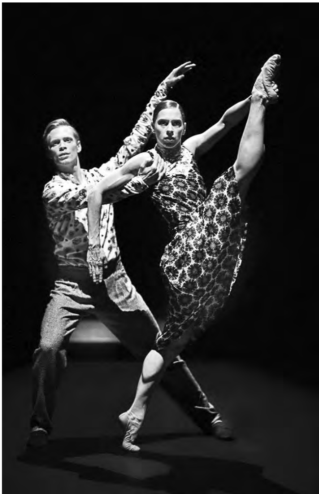
(top) Partita for 8 Dancers was created by Crystal Pite. (bottom) Shut Eye was performed in New York City Center in 2019, the tour the NAF supported. Choreographers are Sol León and Paul Lightfoot.