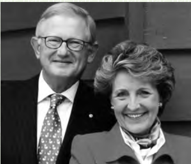
Under the Patronage of Her Royal Highness Princess Margriet of the Netherlands and Professor Pieter van Vollenhoven