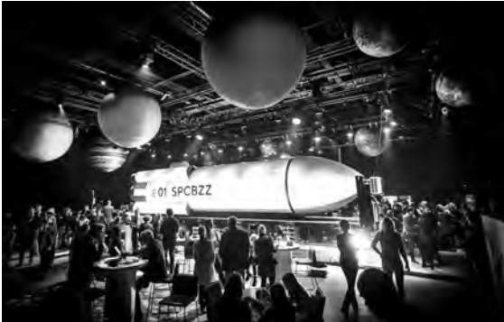
Spacebuzz visiting NAF Houston.