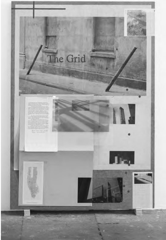
On Walking (The Grid), 2019; 62 x 89 cm / 24 x 35 in. Screen print, inkjet and laser prints, image transfer, gouache and graphite on wood.