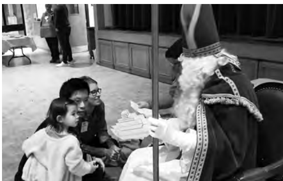
Families enjoying a visit with Sinterklaas.