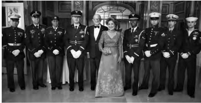
Professor Pieter van Vollenhoven and HRH Princess Margriet of the Netherlands with members of the United States Military