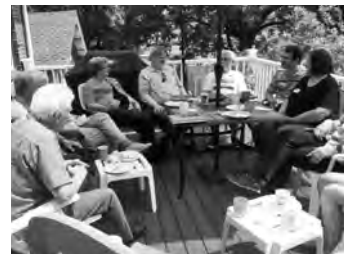
Dutch Lunch 2, June 10