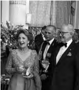
HRH Princess Margriet of the Netherlands and Professor Pieter van Vollenhoven enjoying the festivities