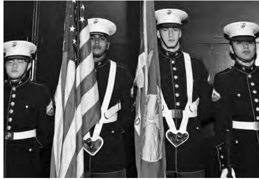
United States Marine Corps Marine Security Guard Detachment from the United States Embassy in The Hague