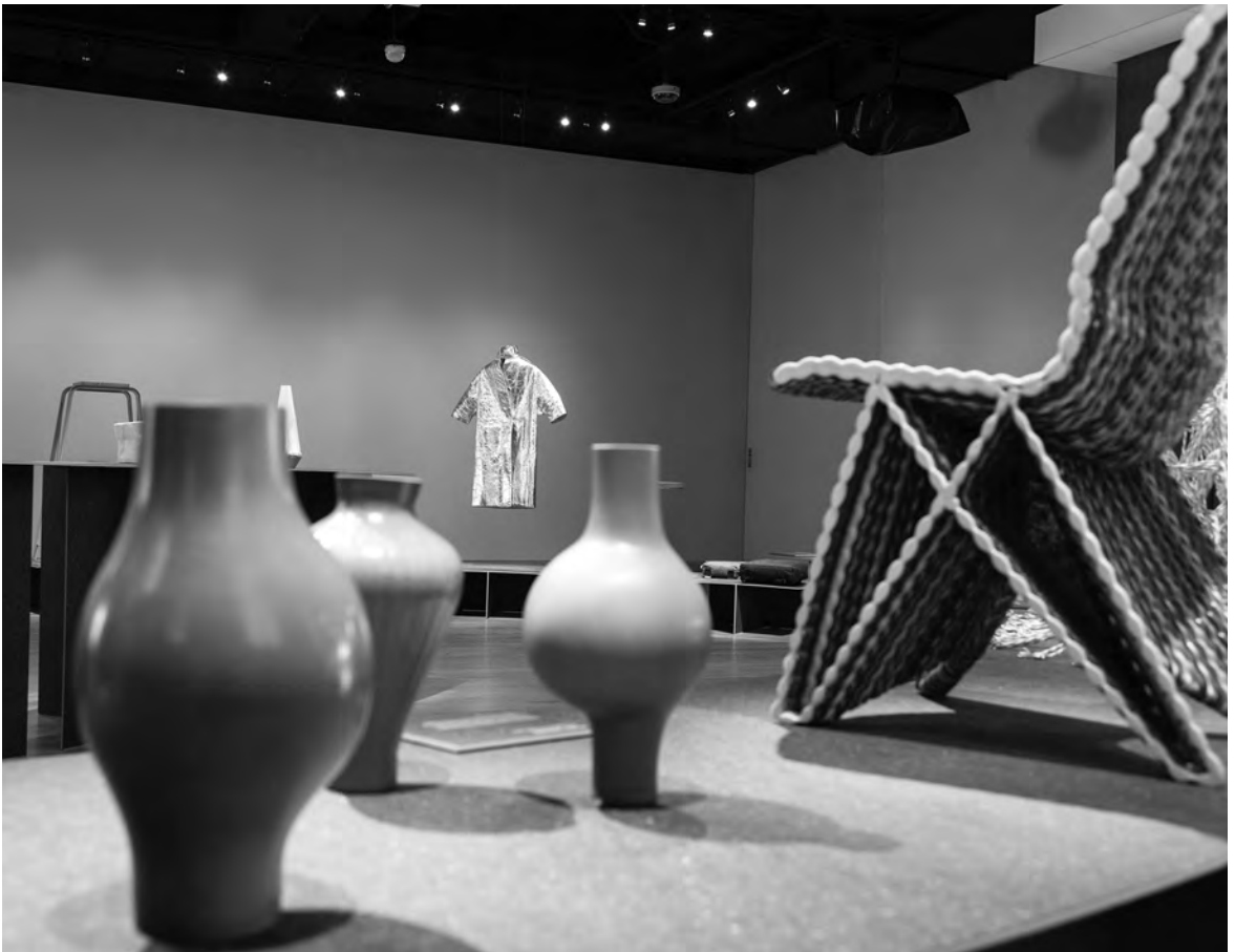
Design Transfigured/Waste Reimagined exhibition courtesy of Georgetown University