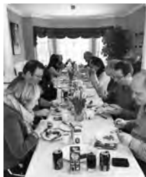
Dutch Lunch 1, March 10

The NAF thanks all of the luncheon hosts and their guests for this wonderful series.