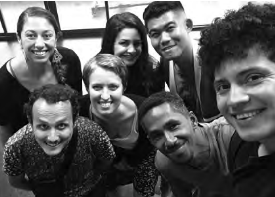
Otherwise US and Dutch cast.

To support the costs associated with recording an album for release in 2020. SPCH+Drums will be working with Dutch musician Sannety, to further explore deep rhythmic concepts such as micro-timings and uncommon patterns. They plan to generate an entirely new quartet by adding 2 acclaimed percussionists, for which they will compose and record a new body of work.