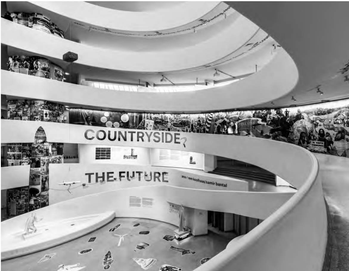
Installation View: Countryside, The Future, February 20 - August 14, 2020.