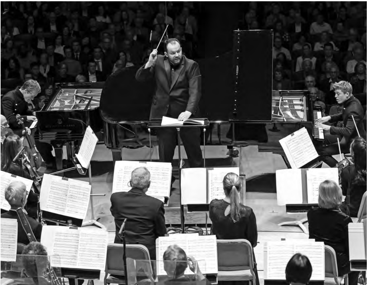
Pianists Arthur and Lucas Jussen with Andris Nelsons and the Boston Symphony Orchestra in the Poulenc Double Piano Concerto.