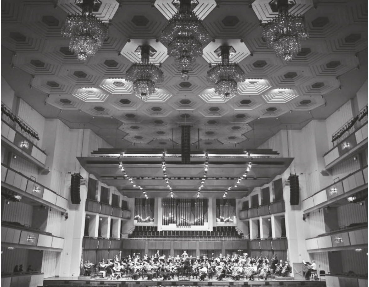
The Royal Concertgebouw Orchestra's 22nd tour to the USA celebrating the 50th anniversary of the John F. Kennedy Center for the Performing Arts, in Washington DC, in November 2016