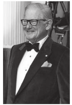
Professor Pieter van Vollenhoven