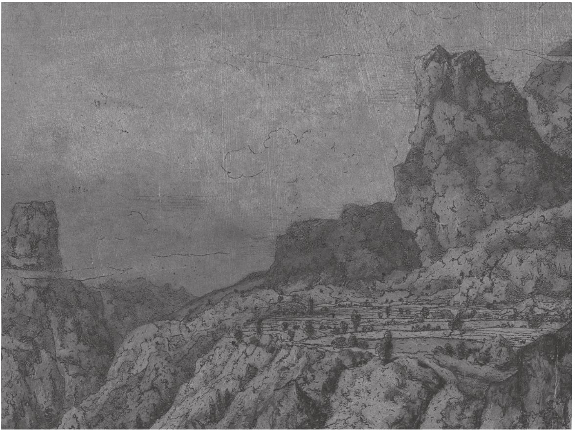
Hercules Segers, Dutch, ca. 1590–ca. 1638. Mountain Valley with a Plateau. Date: ca. 1625–30. Line etching, drypoint, and metal punch printed in blue-green, on a yellow-green ground, colored with brush; second state of two. Sheet: 4 1/8 x 5 7/16 in. (10.5 x 13.8 cm)

In support of the exhibition The Mysterious Landscapes of Hercules Segers on view February through May, 2017. Dutch artist Hercules Segers (ca. 1589 - before 1638) was one of the most inventive minds of his time, known for his otherworldly landscapes of astonishing quality. He developed a unique style of printmaking, incorporating color, a groundbreaking new method, strongly influencing other artists, including Rembrandt van Rijn. This exhibition was co-organized by The Metropolitan Museum of Art and the Rijksmuseum, and was the first to display all of Segers' rare prints together. It featured over 100 works, including rare drawings and prints and a selection of paintings.