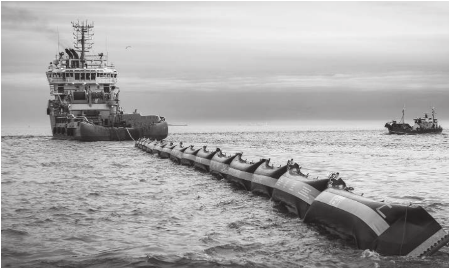
The Ocean Cleanup has deployed a 100 meter-long barrier segment in the North Sea, 23 km off the coast of The Netherlands. It is the first time our barrier design is being put to the test in open waters.