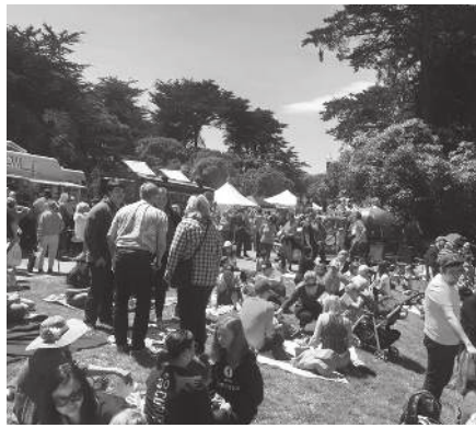
San Francisco King's Day Celebration