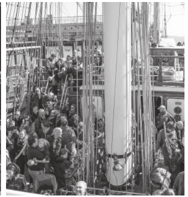
NAF-Biz New York: Family Day aboard the Stad Amsterdam, Chelsea Piers, Hudson River, New York City