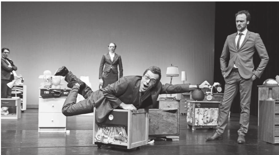
Scene from Expeditie Peter Pan , Brooklyn Academy of Music