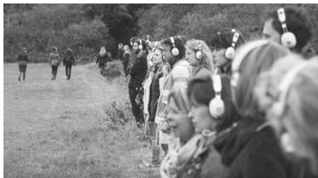
Scene from AMONG US