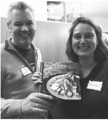
NAF Southern California: Participants at Indo Dutch Kitchen Secrets event at Van Tilburg, Barnvard and Soderbergh Architects, AIA, in Santa Monica