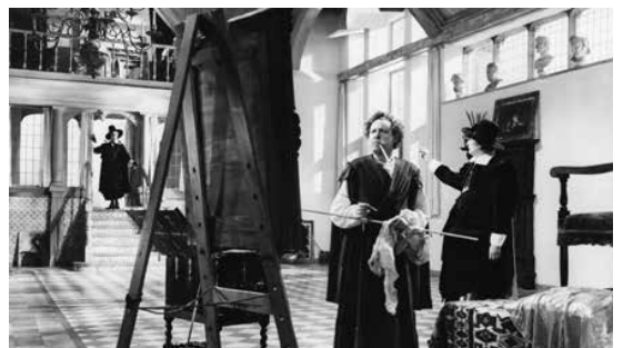
Still from Rembrandt, 1936. Director: Alexander Korda. With Charles Laughton, shot in black and white with close Rembrandtesque attention to light, this film tracks Rembrandt's reputation from its height to his quiet descent into loneliness and isolation.

To support Van Gogh Up Close at the Philadelphia Museum from February 1 - May 6, 2012. Forty-five masterpieces by Vincent van Gogh (1853-1890) were brought together, including eleven works loaned by collections in the Netherlands, including Gemeentemuseum, the Hague; Kröller-Müller Museum, Otterlo; and the Van Gogh Museum, Amsterdam.