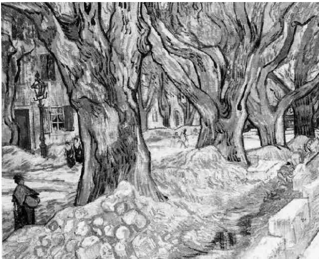
Road Menders at Saint-Remy, 1889. Vincent Willem van Gogh, Dutch, 1853–1890. Oil on canvas, 28 7/8 x 36 1/8” Framed: 41 1/8 x 49 x 3” The Cleveland Museum of Art, Gift of the Hanna Fund, 1947.

From among the many high quality applications received, the Cultural Committee of the Netherland-America Foundation awarded grants in 2011 to the following projects, persons and institutions.