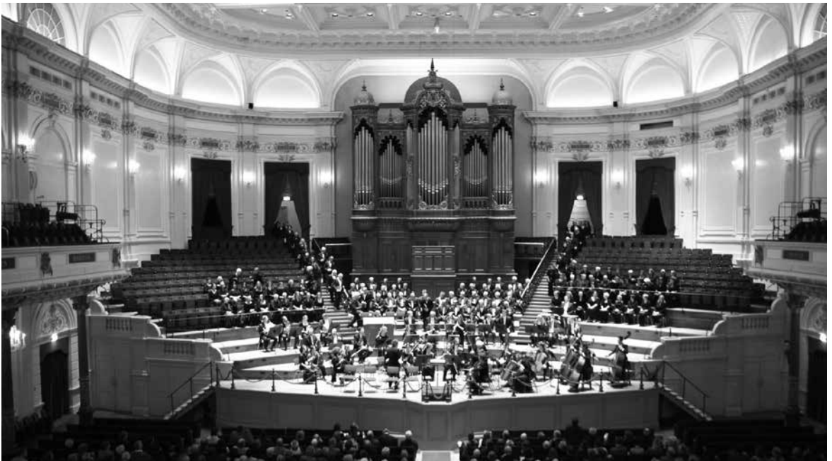
Hudson Valley Singers and the Concert Choir of Bergen op Zoom filing into the Concertgebouw, Amsterdam.