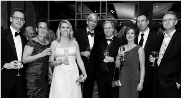
Guests of Rabobank International