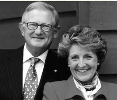
Under the Patronage of Her Royal Highness Princess Margriet of the Netherlands and Professor Pieter van Vollenhoven