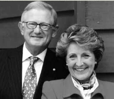
Under the Patronage of Her Royal Highness Princess Margriet of the Netherlands and Professor Pieter van Vollenhoven