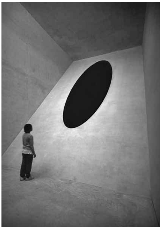
The Origin of the World , Anish Kapoor