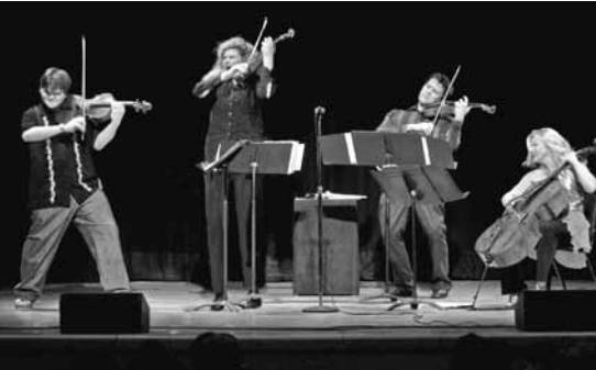
ETHEL in performance