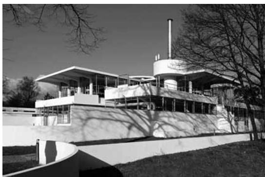
Sanatorium Zoonstraal

To support the World Monuments Fund/Knoll Modernism Prize award ceremony and lecture at the Museum of Modern Art. The prize was presented to Bierman Henket architecten and Wessel de Jonge architecten for their restoration of Sanatorium Zoonstraal (Hilversum).