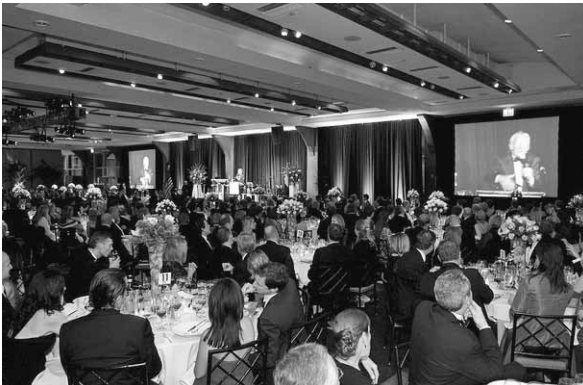
A view of the Majestic Ballroom at Pier Sixty